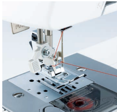
Easy needle threading